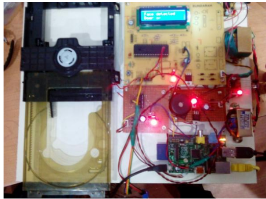
Figure 6.ATM door opens when face detected.

When the face is detected the door opens automatically and displays the message "FACE DETECTED DOOR OPENS" in the LCD display. It is shown in figure 6.