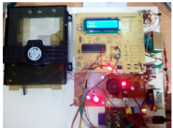
Figure 8. When the ATM is occupied the door will not open.

When face is partially covered or fully covered the face is not detected and the ATM door will not be opened. When there is a person inside the ATM the door will not open and shows the message "full wait".