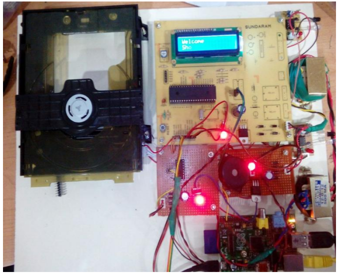
Figure 3. Original setup of proposed model

The image of every user entering the ATM is stored in the memory unit of Raspberry pi with date and time of their entry. This images can be used by the police in case of robbery occurs. If the vibration sensor on the door or ATM machine is triggered the door will be automatically closed and SMS alert will be sent to both the officials and the police control room. The alarm placed in the ATM booth will be triggered and alerts the public around the area. The original setup of proposed model is shown in figure 3.