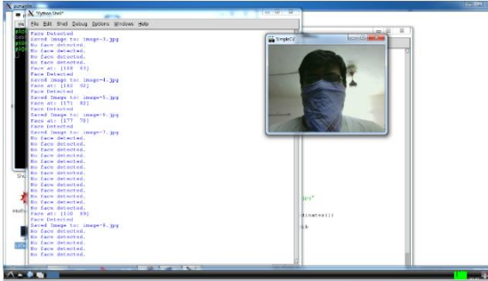
Figure 7. Face not detected.

When face is partially covered or fully covered the face is not detected and the ATM door will not be opened. When there is a person inside the ATM the door will not open and shows the message "full wait".