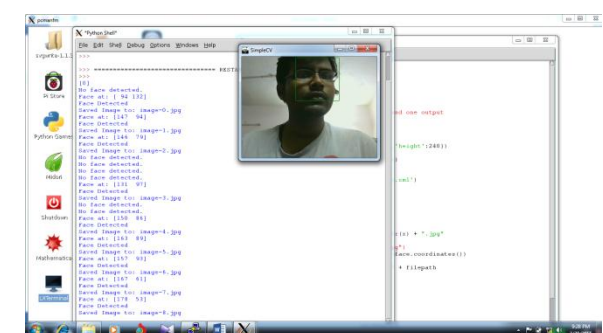
Fig 5. Face detected which shows a green rectangle around the face.

When the face is detected the door opens automatically and displays the message "FACE DETECTED DOOR OPENS" in the LCD display. It is shown in figure 6.